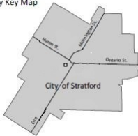
City Key Map

The purpose of the application is to create a right of way with an approximate width of 2.42m, an approximate depth of 26.59m and an approximate area of 64.3m 2 . (Parcel B)