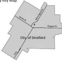
City Key Map

Purpose: The purpose of this application is to sever the property at 197 William Street into two parcels. The severed and retained parcels will both have a frontage of 6m and an area of 181.1m 2 . The westerly parcel will be added to 195 William Street and the easterly parcel will be added to 199 William Street as lot additions.