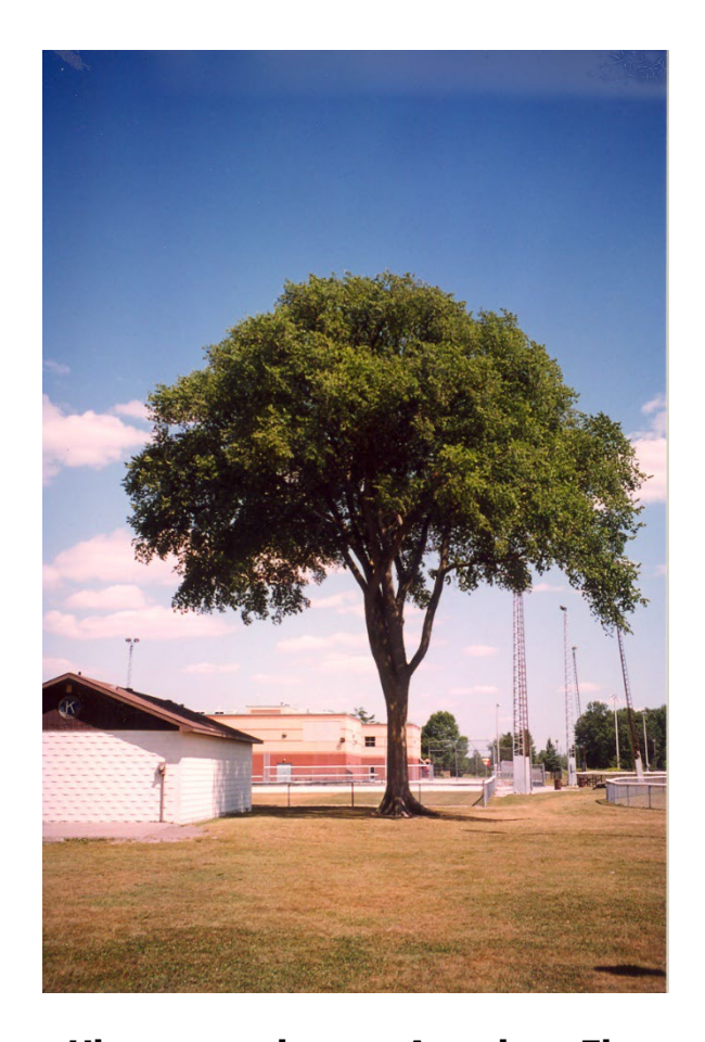
Ulmus americana - American Elm