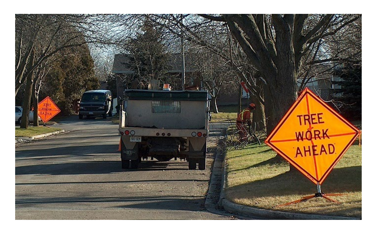
Park Staff – Cyclical Pruning

Park staff maintain small trees up to 10 metres in height. Present staffing consists of five full-time Parkskeepers, one Certified Arborist as well as seasonal crews for Parks & Forestry. A minimum of two of these staff have been designated to the forestry crew and as much time as is physically possible is allotted to our small tree maintenance program. Small tree maintenance begins with the initial planting of the tree on city streets, boulevards, parks, and natural areas. Annual tree planting is carried out each spring and consists of re-treeing older neighborhoods (infilling), replacement tree planting for large trees removed under our large tree maintenance program, citizen requests, new subdivision, parks, and natural area plantings. A five-year rotational pruning cycle (1989) has been implemented, whereby all trees planted since 1989 are inspected every five years and any corrective pruning required is carried out to ensure proper branch structure and a well-balanced healthy tree. This systematic pruning will minimize costs involved in the pruning of larger trees in the future. A five-year rotational pruning cycle has been implemented (1993), whereby all trees to a height of 10 metres are inspected and properly pruned at time of inspection. This includes tree climbing as well as pole saw work.