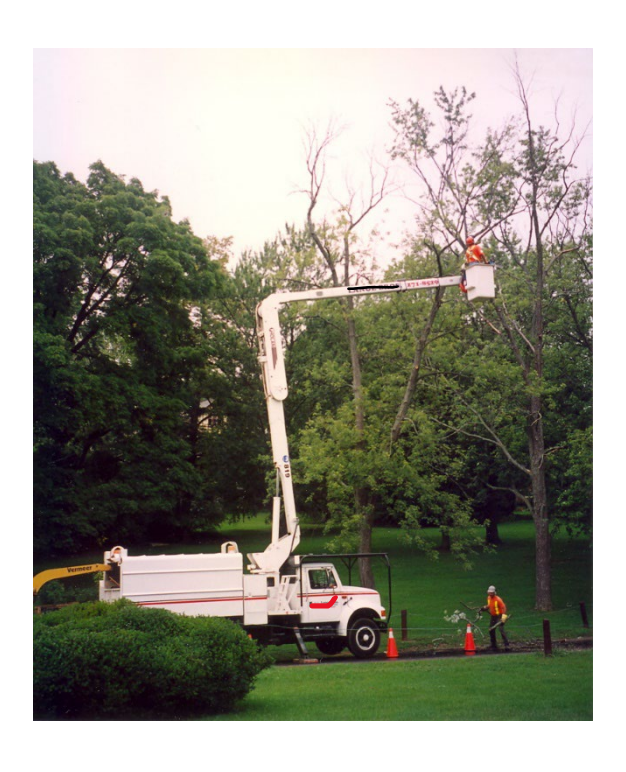
Tree Pruning & Removal – Contracted Services

A very extensive hydro pruning list is provided to the Community Services Department by Festival Hydro for priority pruning. As of 2023, January – April will be dedicated to Festival Hydro line clearing requirements.