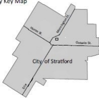
City Key Map

Purpose: The purpose of this application under Section 44 of the Planning Act, R.S.O. 1990 is to reduce the minimum number of parking spaces to be made available to the public for the subject lands.