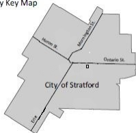
City Key Map

City of Stratford Council will hold a public meeting on Monday, August 16, 2021, at 6:00pm in the Council Chambers in City Hall, 1 Wellington Street, Stratford to hear all interested persons with respect to the Zone Change Application (File Z09-21) under Section 34 of the Planning Act, R.S.O. 1990.